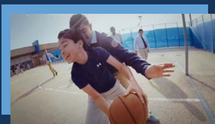
KIPP Texas Public Schools: Rising Together

We see each student as an individual, matching what sparks their curiosity with what and how we teach. We challenge their minds while nurturing their joy of learning—whether they are working to read their first word or solve their first calculus problem. We prepare every student for college and celebrate all paths to a fulfilling life. And we join together with families and communities, partnering to pursue the more just world we all want to see.