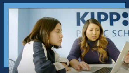
KIPP Public Schools: 25 Years